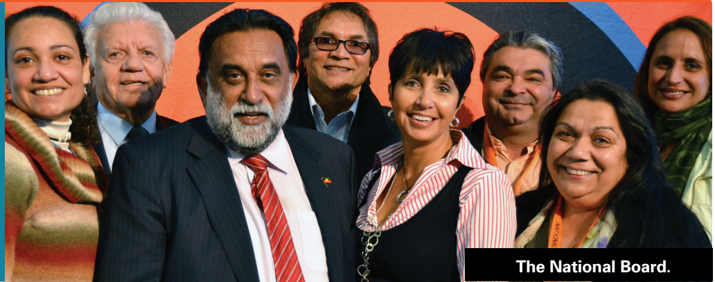
The National Board.